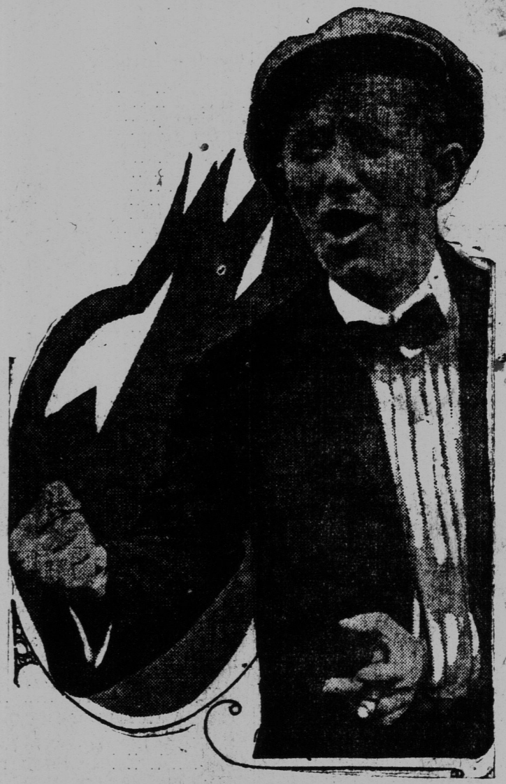
The Fan—Specially posed by George M. Cohan.

chers. Forget it. I've seen this Bob Shawkey, and if he isn't a pitcher never was a guy with a right arm. It wouldn't surprise me to see Coffey stick this kid in to open the series. Connie is a wise fellow and a hard one to dope.