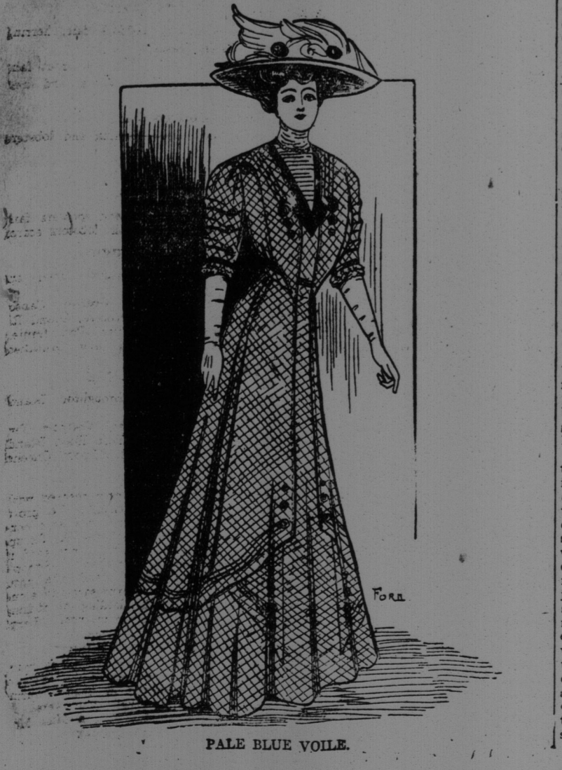
PALE BLUE VOILE