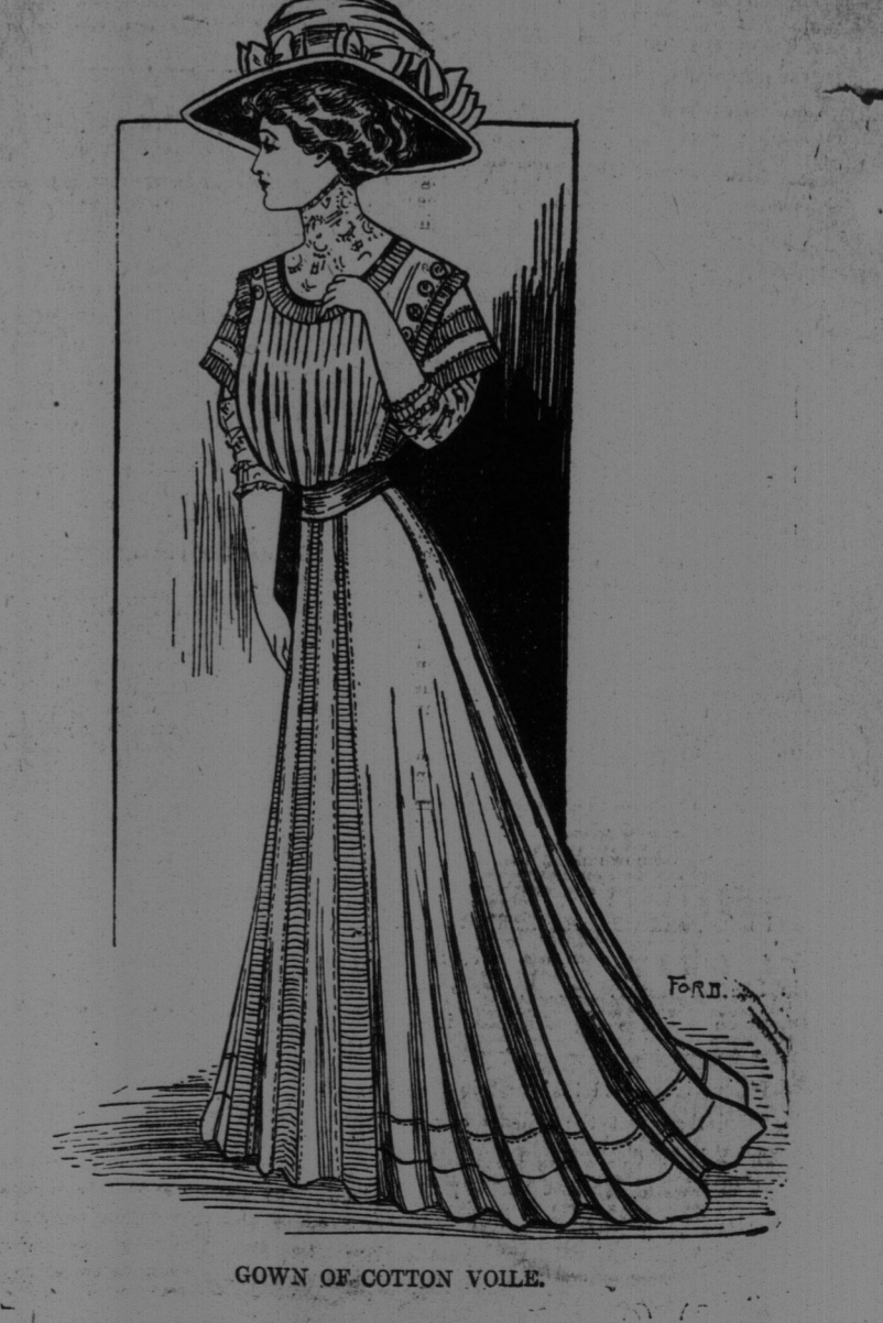
GOWN OF COTTON VOILE