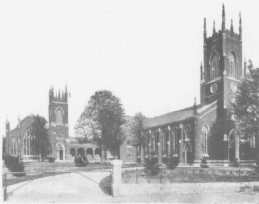
ST. PAUL'S CATHEDRAL AND BISHOP CRONYN HALL