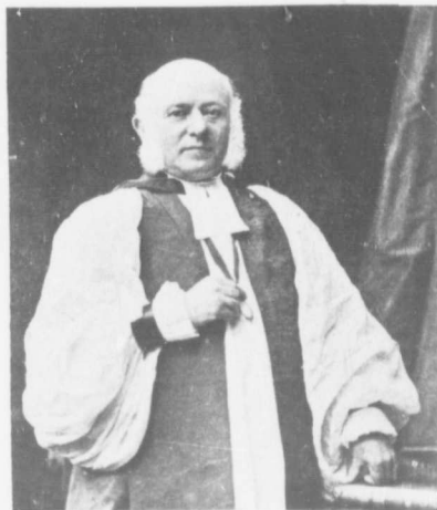
BISHOP HELLMUTH 1871-83