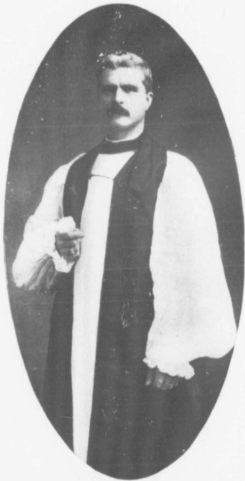
BISHOP WILLIAMS 1905