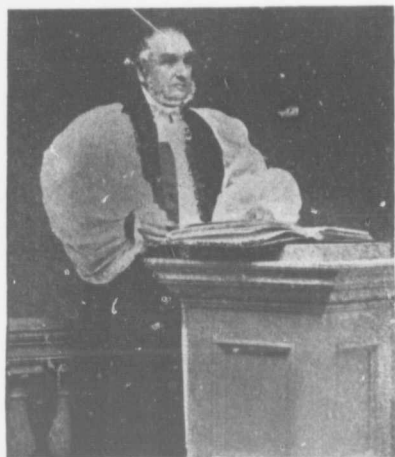
BISHOP CRONYN 1857-71