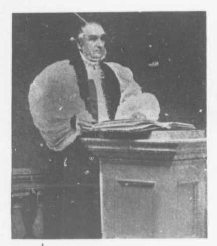
BISHOP CRONYN 1857-71