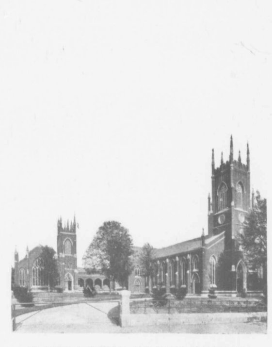
ST. PAUL'S CATHEDRAL AND BISHOP CRONYN HALL