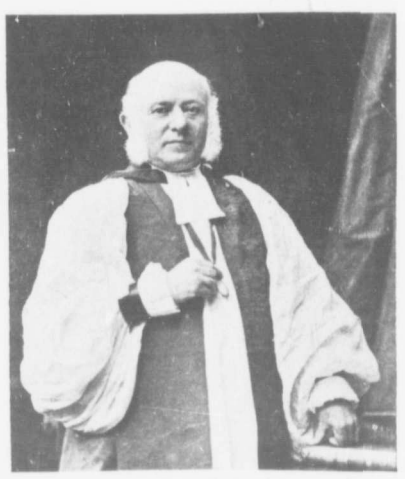
BISHOP HELLMUTH 1871-83