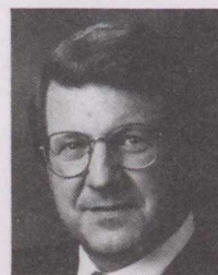
Lloyd Axworthy, P.C., M.P. (Winnipeg South Centre, Manitoba)