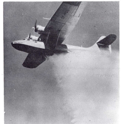
The Canso, veteran aircraft of the Second World War, still serves firefighters as an efficient water bomber.

Organized forest-fire protection in Canada can be traced back to the early 1900s. Its effectiveness was at first limited by lack of manpower, inade-