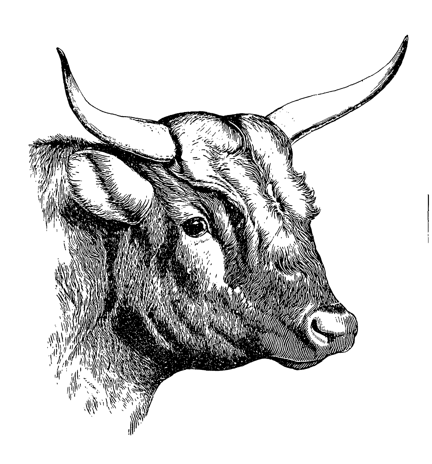
HEAD OF PURE-BRED DEXTER-KERRY BULL.