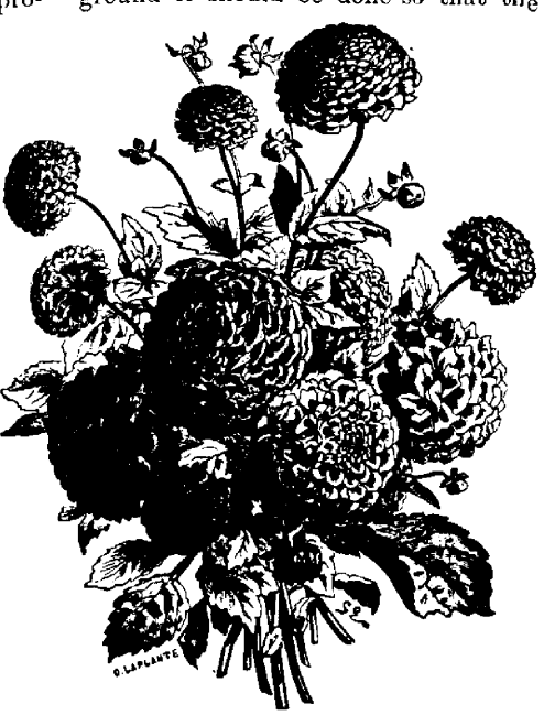
BUNCH OF DAHLIAS.

In planting Dahlias in the open ground it should be done so that the