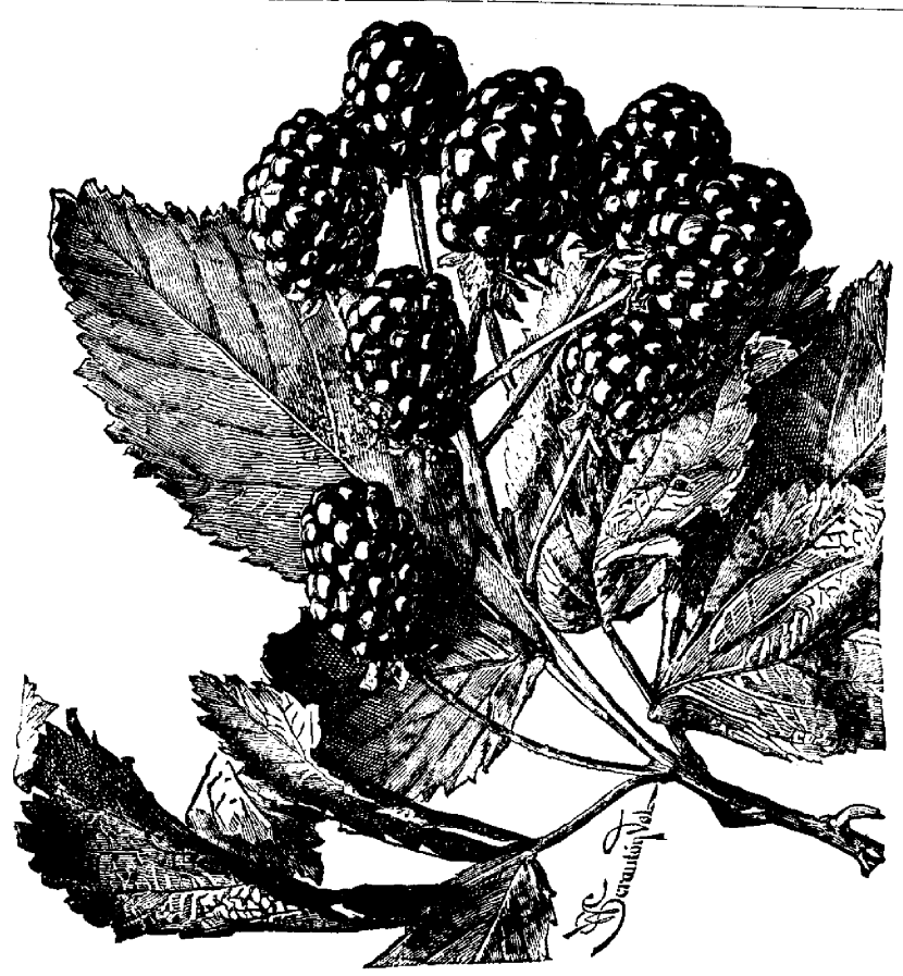
THE EARLY HARVEST.

Grand Trunk Railway, however, the Kittatinny is too tender, and for our northern sections we recommend the