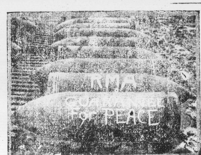
OFFICIAL PHOTOGRAPH TAKEN ON THE WESTERN FRONT. BEST PART OF THE ALLIED DEFENSIVE SYSTEM

Jabbed a bit of glass tubing into the very heart of the wound, probing vigorously into the live liesh. The doctors gasped. Edwards went white,