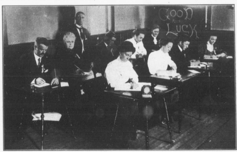
"GOOD LUCK" TEACHER TRAINING CLASS AT PLUMAS, MAN., SHOWING MEMBERS WRITING ON EXAMINATION. THE PASTOR IS STANDING AT THE REAR.

testimony we cover from innureus of our pastors everywhere. The Teacher Training Leaflet has alterady been sent to every minister, every S. S. Superintendent, every League Will be freely and cheerfully sent in any number to any of our friends interested. Simply drop a line to the General Secretary, and remember that no charge whatever from first to last is attached to this work, except, of course, the actual price of the text-books. The recent action of the General Board makes it possible for examinations to be held at any time, and whether it be a class of a score or a single individual student,