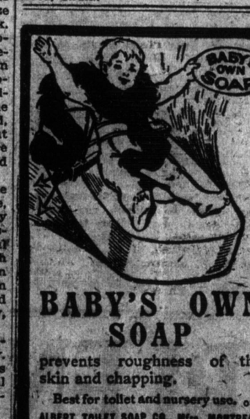
Prevents roughness of the skin and chapping.