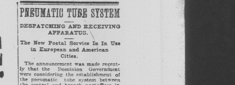
PNEUMATIC TUBE SYSTEM

Remove traces of petroleum from either vessels or material by washing with alcohol and rapidly cleaning and rendered quite odorless.