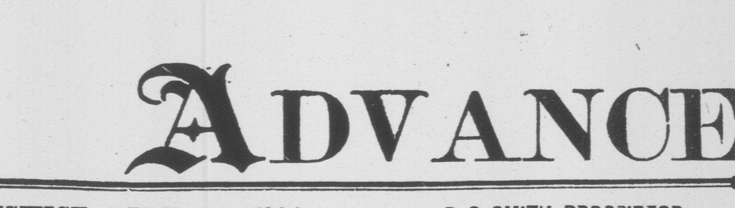
Vol. 2, No. 25 CHATHAM, NEW BRUNSWICK, APRIL 28, 1904

"I'm not taking it," replied Archie, "I'm just showing it to you. It's a very dirty and cracked," he said.