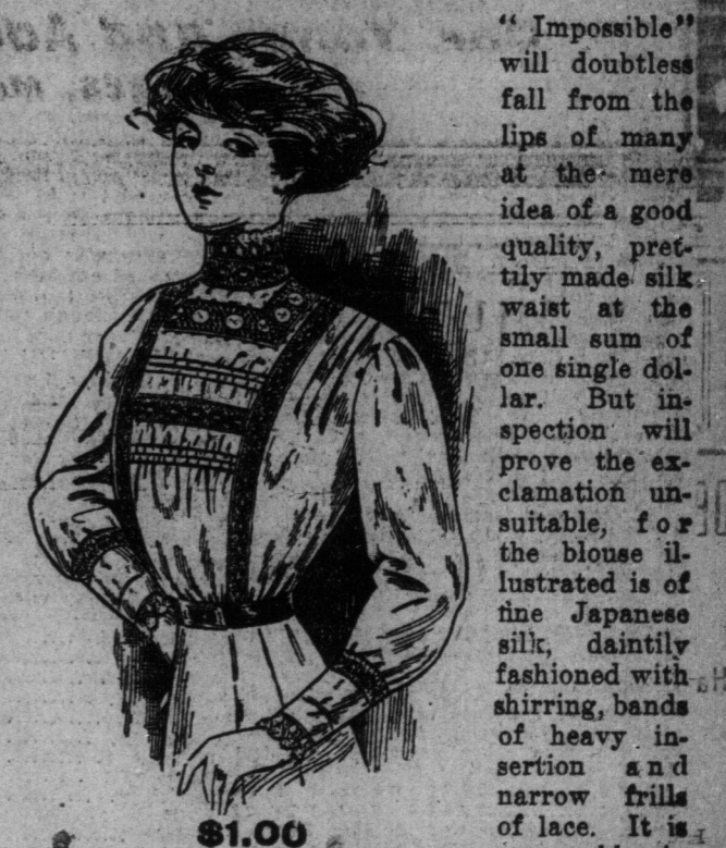
both black and ivory, and in all sizes. Very special price. . . . . $1.00

A Wonderful Combination of Good Style, Good Material, Good Workmanship and Moderate Price.