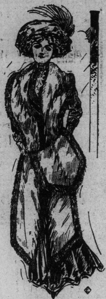
Price of This Set, $635

The Muff and Capeline illustrated is one of our handsomest provisions for formal wear.