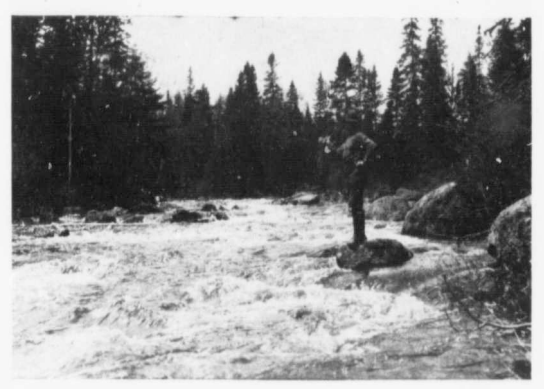
VERMILLION RIVER, QUE

trout; they often run as high as five and six pounds. The record for the preserve is seven and a half pounds. The best time in Lake Edward and surrounding district for fly fishing is from the opening of the season, May 1st, to about the first week in June, also in September. There is good fly fishing in early summer along the shores of Lake Edward and trolling with the Archer Spinner in the lakes at any time meets with success. Amongst the flies found most successful are the Parmachene Belle, Brown Hackle, Black Hackle, Montreal Fly, Silver