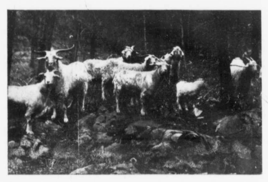
MOUNTAIN GOAT-JASPER PARK

VISTA, MAN. From Winnipeg, 193.6 Miles, Good shooting within two miles of the railway. Prairie chicken and duck. Country open. Guides not needed.