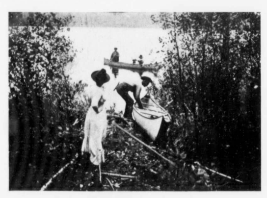
A PORTAGE-LAKE EDWARD, QUE.

winter, and their habitat in the fall of the year. The township of Lake is almost unsettled and along Beaver Creek, Burnt Lake, Whetstone Lake and Capeway Lake there is good hunting.