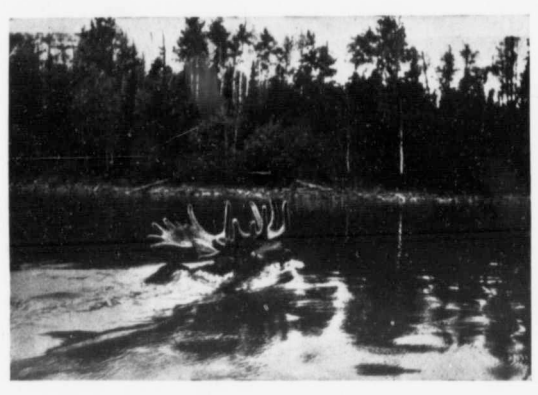
MOOSE SWIMMING-RAINY LAKE

Ten miles further on the Nipigon is reached at Cameron Falls, the finest water power in the Algoma district, and fourteen miles further on we reach Nipigon station. The line skirts Black Bay and reaches Port Arthur on Thunder Bay.