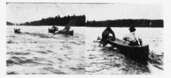
RIDING A BULL MOOSE-RAINY LAKE, ONT.

the best fishing on the river will be found, and it is a fact that almost inavaribly good sport will be had, while the Indians and guides are carrying the duffle around the rapids.