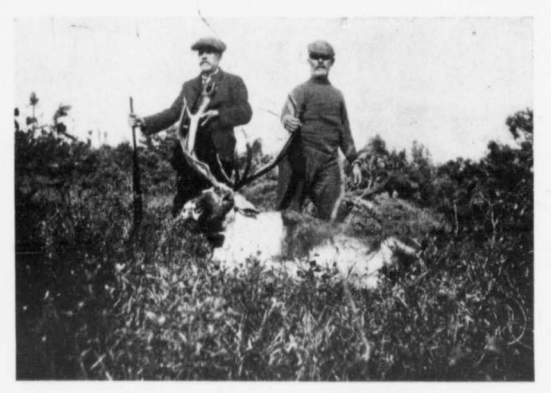
CARIBOU SHOT NEAR BANNING, ONT.

NORTH LAKE, ONT. From Port Arthur, 69.8 Miles. Good brook trout fishing is to be had in the streams near this point.