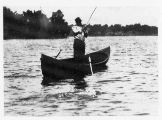
PLAYING A BASS-RIDEAU LAKES