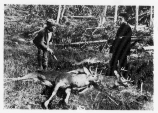
DEER SHOT IN PARRY SOUND DISTRICT

There are no preserves, the whole district is open to the public and good sport is fairly certain. Guides can generally be secured for about two dollars a day. Hunters should take their own decoys.