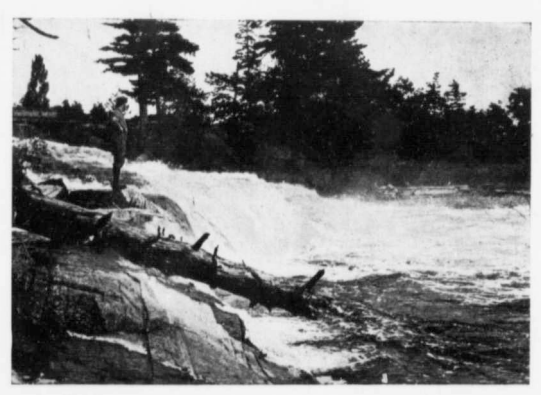
FALLS NEAR BOLGER, ONT.

can be secured, deer are reported numerous about eleven miles East and nine miles West of the railway. Excellent accommodation can be secured at Bancroft House.