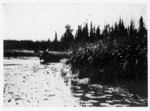
MOOSE-LAKE EDWARD, QUE

Cedar Lake: Large lake trout have been taken up to twenty-five pounds in weight.