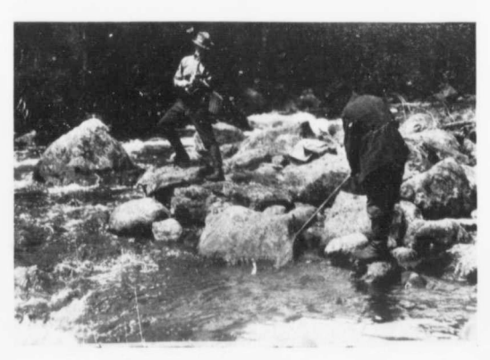
LAKE EDWARD DISTRICT

To-day it is hard to get really good brook trout fishing, but the sportsman who goes to the Quebec and Lake St. John country will be rewarded with some of the best fishing to be had anywhere; the fly fishing starting with the opening of the season, is good to the first week in June and in September again the sport is at its best. During hot weather the trout are caught with live bait and trolls.