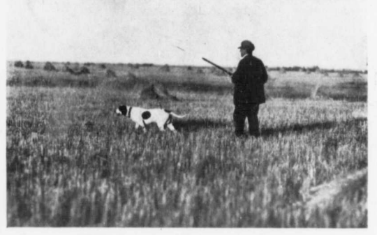
SHOOTING NEAR RADISSON