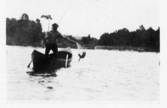
LANDING A BASS-RIDEAU LAKES

with a few short portages a splendid route can be followed right through to the Rideau Lakes. There are plenty of large mouth bass in these waters which afford good sport.