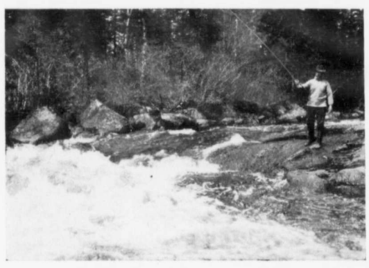
RIVIERE ALGONOUIN, LAKE EDWARD DISTRICT, OUE.

and large mouth variety being plentiful and running to good size. From Opinicon, with only a short portage, is Hart Lake, and another short portage from Hart into Crow Lake, both good waters. Another lake reached with only one short portage