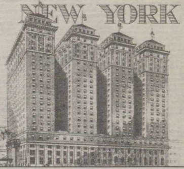
SEVENTH AVENUE, 32ND AND 33RD STREETS. Cable Address - "PENNHOTEL"