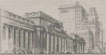
OPPOSITE PENNSYLVANIA STATION Connected by Subway Passage