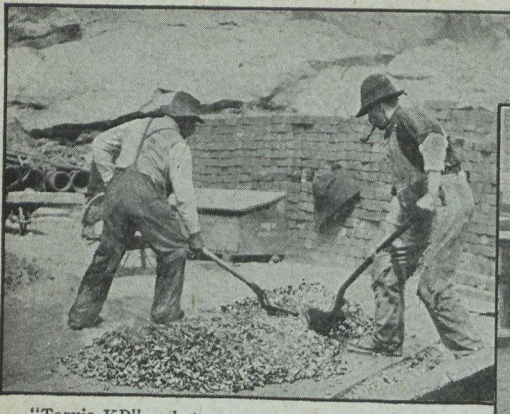
"Tarvia-KP" and stone are turned over by hand until all stones are coated. Then sand is added.