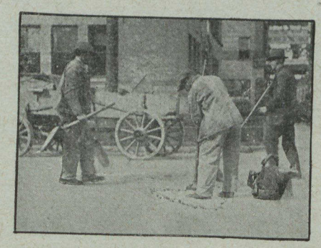
Screenings are scattered over the seal-coat and the patch is again tamped.