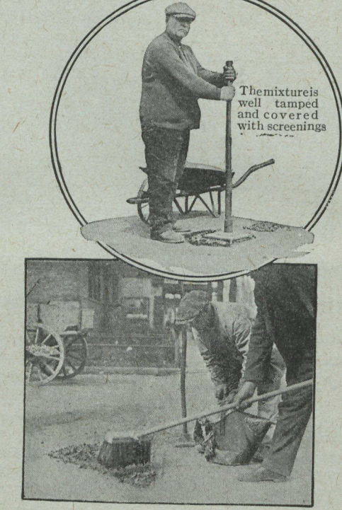
A seal-coat of ½ gallon of "Tarvia-KP" to the square yard is spread over the patch.

Out nearest office will gladly send you an illustrated manual of instructions showing each step in patching a road with "Tarvia-KP."