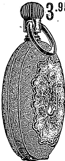
Hunting Case GENT'S OR LADIES' SIZE.

3.95 FREE EXAMINATION of all our Watches, and you can refuse to accept and return them at our expense if not equal in every respect to what we claim them to be. No other house in the world can sell as cheaply as we can. The case of watch advertised to-day is beautifully engraved, heavily 14 K. Gold plated, hunting, stem, wind and set. Will last a lifetime. Movement is one of the best made and fully guaranteed, and the watch looks like a GENUINE $40 SOLID GOLD WATCH . We send it by express, C.O.D., to anyone, and if satisfactory, you pay agent 3.95 and express charges, otherwise return it. If money is sent with order we pay all express charges and give a beautiful Chain Free. Write whether Gent's or Lady's. Order to-day, as watches are advancing in price and our stock may not last long. All orders from Canada and B.C. will only be filled if cash is sent with the order.