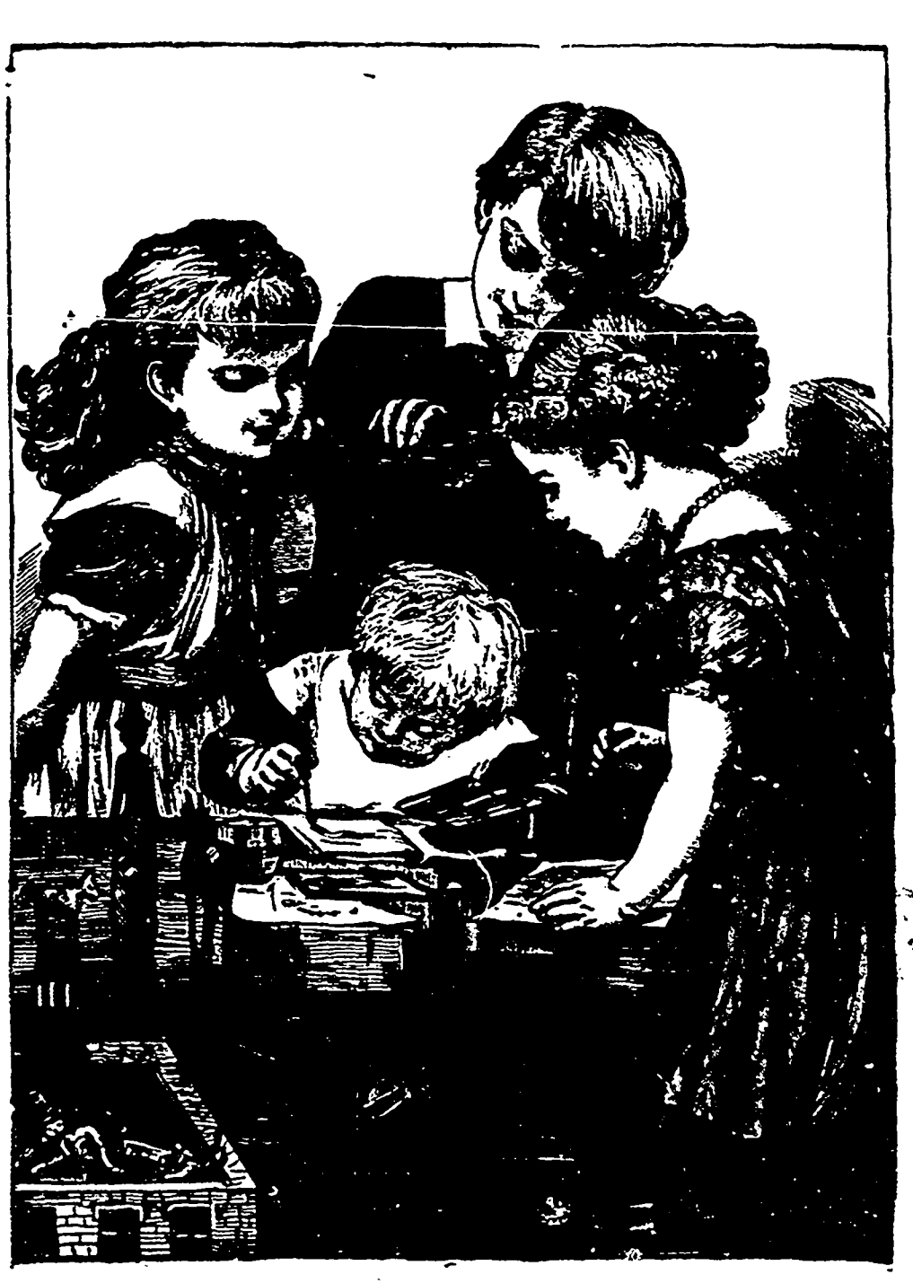
LEARNING TO PAINT

But when I wanted to use them and was wild to paint something, anything, I' did not know how to begin. This is what I want to tell you: how to commence at the very beginning of the most lovely play and study in the world for you. You all have Sunday-schog papers that have retty pictures in them, and you can and other little pickres that your maimas will give to yet. These you, can folour so they will be pretty and you will be so much intersted in