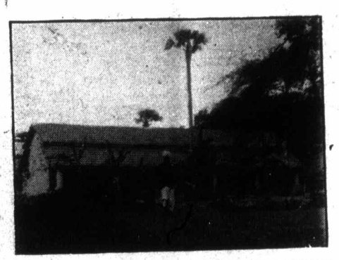
Block of 5 Rooms with Small Cooking Rooms Behind, 13 Rooms for Men and 4 for Women.