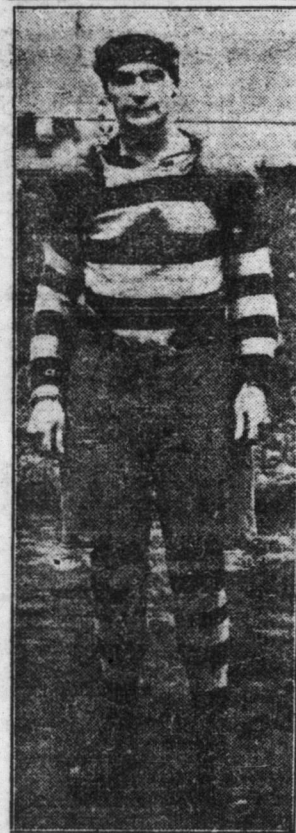
Canada's Finest Athlete Lionel Conacher, aged 22 years, is declared to be the best all-round athlete in the Dominion. He has excelled in football (he is captain of the Argonauts) hockey, lacrosse, baseball, boxing and wrestling. He has just refused $5,000 a year to become a professional hockey player.

The question on everyone's lips is: "If it is war, can the struggle be kept within the borders of Turkey, or must we face another world conflict, with Russia, Germany and Turkey lined up against Britain and France."