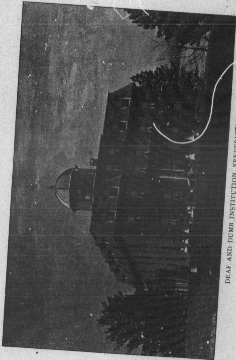
DEAF AND DUMB INSTITUTION, FREDERICTON, N. B.