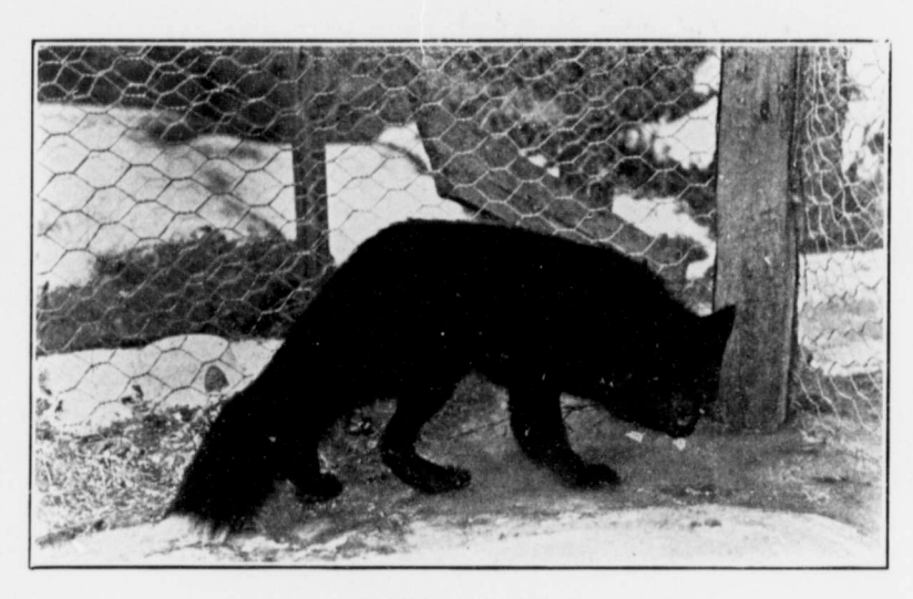
"PRINCE ROYAL" Sire of a Litter of Five Pups in 1913