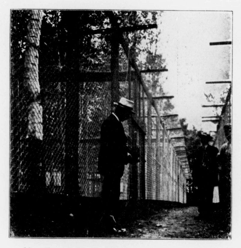
View Showing Outside Wire Fence of a Prince Edward Island Fox Ranch. Within this Enclosure are Pens and Dens where the Foxes are Confined