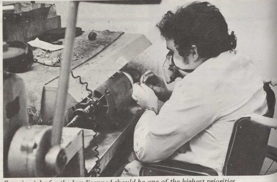
Securing jobs for the handicapped should be one of the highest priorities.

the Canada Employment and Immigration Commission (CEIC) began to develop and implement an affirmative action program within the federal government. While the program is well organized and making progress, it has two major limitations: - the program has been undertaken by