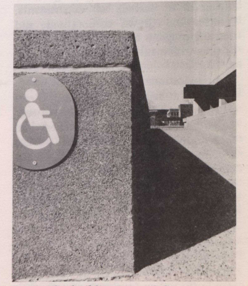
Ramps for building accessibility.

That mental handicaps (learning disabilities, retardation or mental illness) and a previous history of mental illness or a previous history of dependence on alcohol or other drugs be added to the proscribed grounds of discrimination under the CHRA.