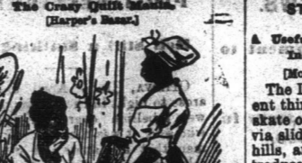
THE CROCK POT