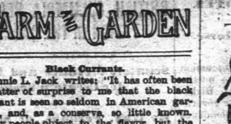
FARM AND GARDEN