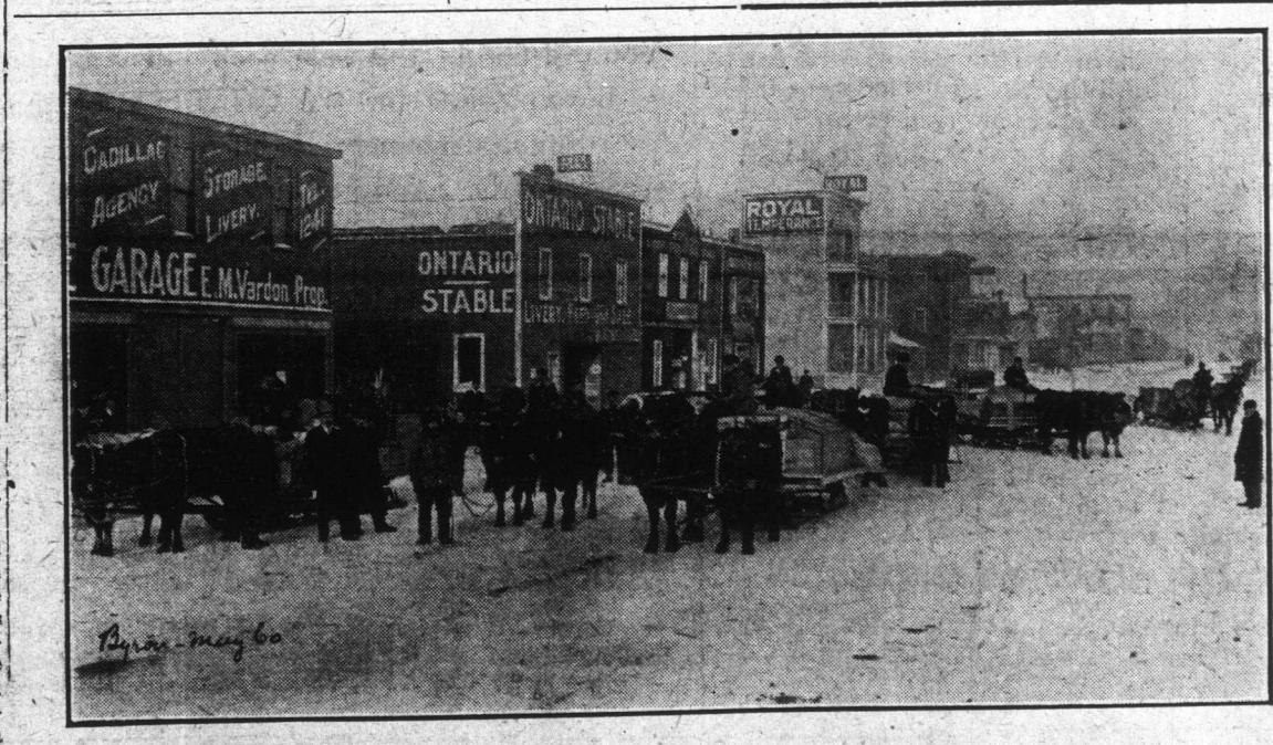
FREADY FOR 500 MILE TREKK TO GRANDE PRAIRIE

TO-DAY'S GRAIN MARKETS. Winnipeg, Feb. 15 .- May 94 %, 94%; July 96*, 95%; October 90%. Cash wheat—No. 1 Northern, 90%; No. 2 Northern, 88; No. 3 Northern, 85 1/4; No. 4, 80; No. 5, 73; No. 6, 671/2: feed, 61. Oats-No. 2 C.W., 33% Barley-No. 3, 57; No. 4, 47, Flax—No. 1 N.W., 2.53.