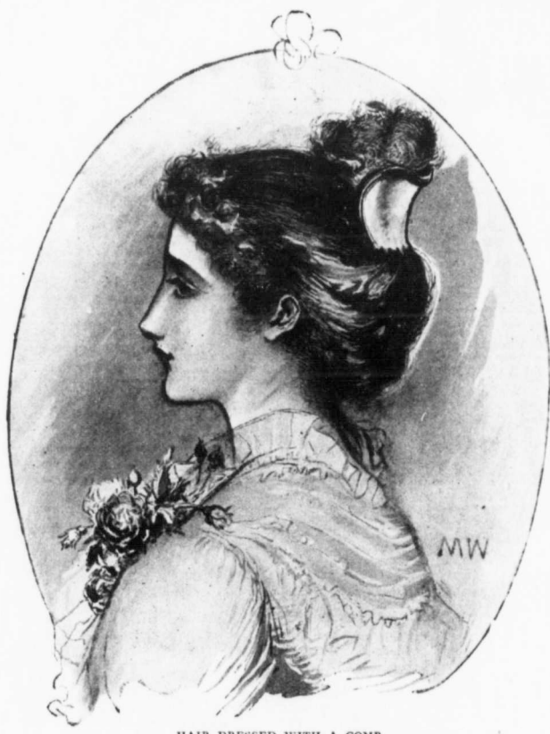
HAIR DRESSED WITH A COMB.

All kinds of small ornamental coverings. capes, boleros, and fichus, are being worn, and just now few people care to go out in the cotton or muslin shirt without adding to it some small adjunct, which may only be a chiffon neck-ruffle, or an ostrich-feather boa. Cotton shirts are more worn for the bicycle than for anything else, as their places are taken by the silk or muslin blouse. Chemisettes or fronts are returning to favour again for wearing with a small coat, and some of them are very pretty. There is still much fluffiness about the neck, but I noticed during the sales that there were many purchases of ribbons made, intended for the neck. These are to be worn twice round, and will be tied in a bow either in front, or at the back of the neck. It has been found that the tight and air-proof stocks so long used have injured the appearance of the throat so much that nearly all the women who care for their appearance are dismissing the stiff collars and replacing them by a wide ribbon necktie, which will be less hot, and more open to the free circulation of the air round the throat.