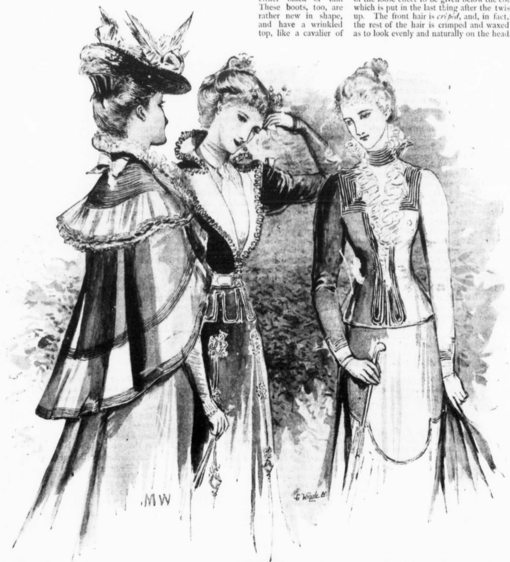
A NEW CAPE.

dressing the hair, which put in rather a late appearance at the very end of the London season. In our sketch entitled "Hait dressed with a comb," is shown the way to dress the hair in the fashion that it has been most worn lately. To give it this effect the hair is not tied, but simply rolled up and twisted into a knot, which must be rather loose than otherwise, and which must be rather loose than otherwise, and the twist must be given with a due remembrance of the loose effect to be given below the comb, which is put in the last thing after the twist is up. The front hair is cripid , and, in fact, all the rest of the hair is crimped and waxed so as to look evenly and naturally on the head.