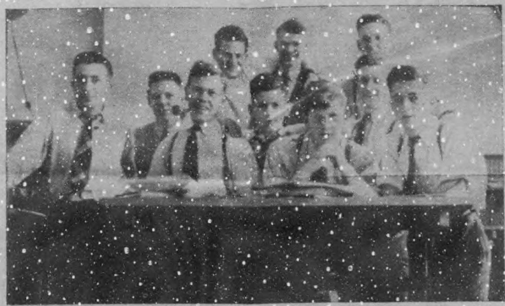
Most of you will recognize in this group of nature's children, familiar faces, but as portrayed here, they represent that cultured class, cream of the Beersmore—yes, verily—the Senior Civics...