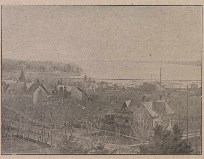
LOOKING N. E. FROM PORT PERRY-LAKE SCUGOG AND ISLAND

fairly entitled to be considered one of the "Wonders of the World" in building. This is a massive structure 725 feet long, 110 feet in width and 65 feet in height at its