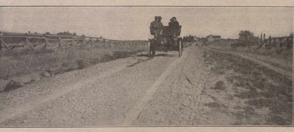
COUNTY ROAD IN WENTWORTH

2. It shall be the duty of every foreman appointed by the road superintendent to keep a close watch on the roads of his division and see that the culverts and bridges