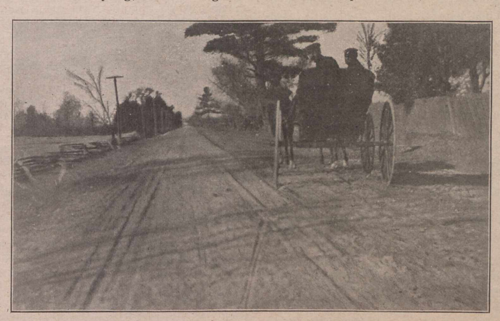
A WENTWORTH COUNTY ROAD

dirt road for summer use is spoiled. Townships which have only broken stone for road metal will receive decided benefit from the use of a steam or horse road roller, which will at once consolidate the stone, and make-a thoroughly good and smooth road for all seasons of the year. There must be a sufficient body of broken stone to consolidate into a compact