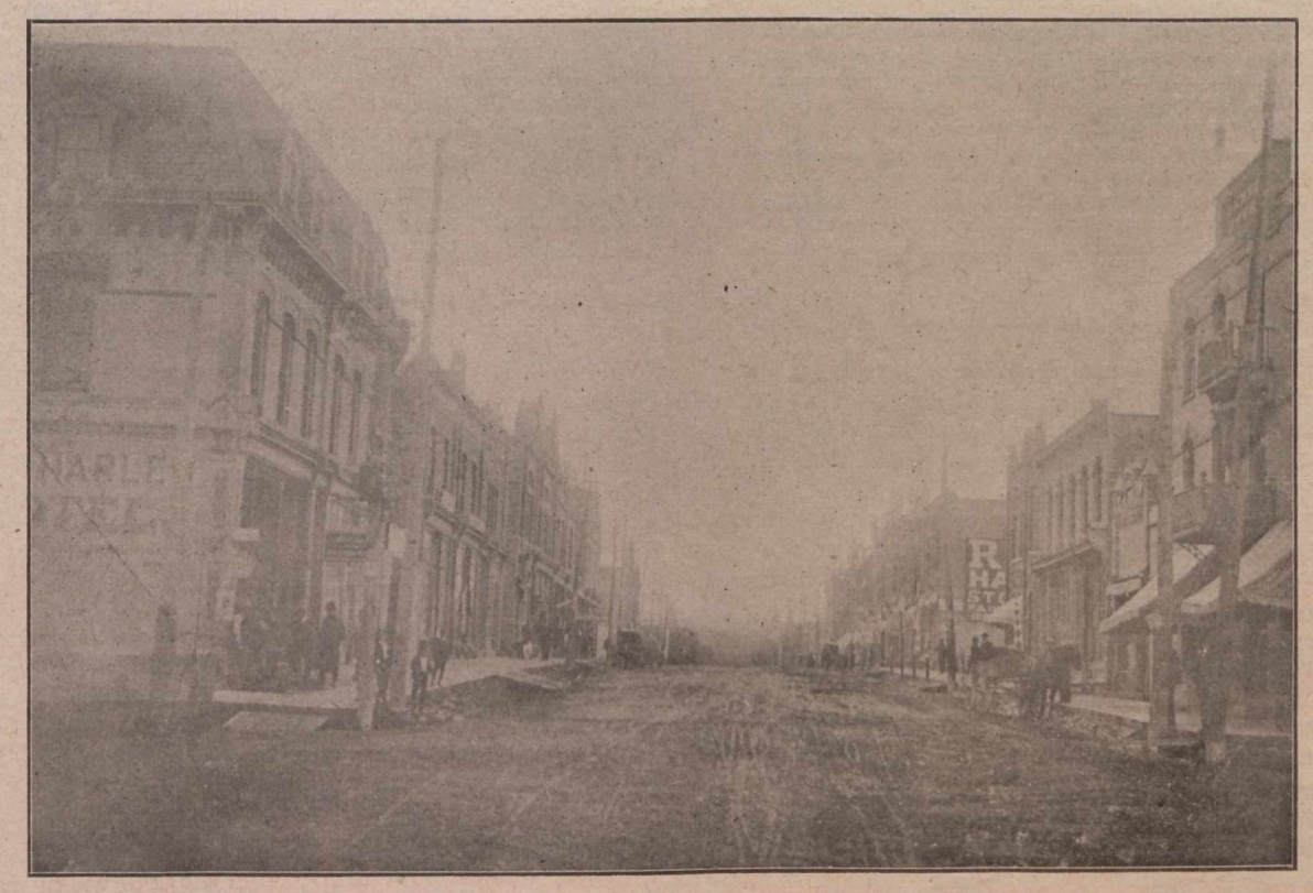
VIEW OF THE EAST END OF QUEEN STREET, PORT PERRY

Cleaning Day." That each mayor issue a proclamation in which he shall request the school children and all citizens to join in a general cleaning of yards and places of business, and the burning of all rubbish accumulated