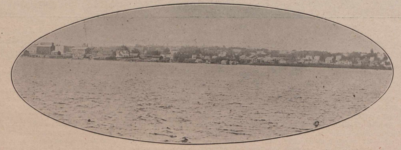
PORT PERRY FROM LAKE SCUGOG

That the League and all cities which are members of this League use their best endeavors to secure in the new