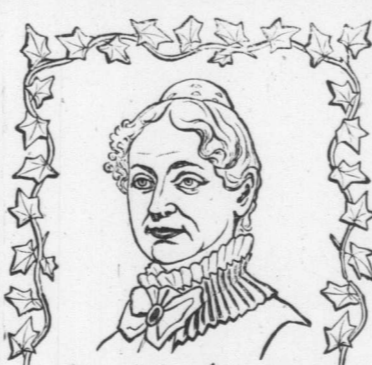
Lydia E. Pinkham