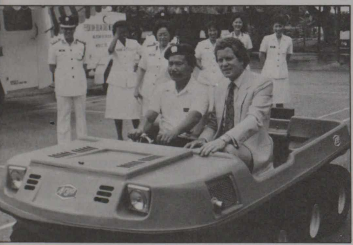
High Commission von Nostitz and Red Crescent representative on a trial run in an Argo.

where" vehicle. It is light, manoeuverable and completely amphibious, able to function on steep slopes and deep water. These characteristics will make the vehicles a valuable resource for the Red Crescent Society in its rescue and relief operations, particularly during the monsoon season when floods can leave large numbers of civilians stranded and homeless.