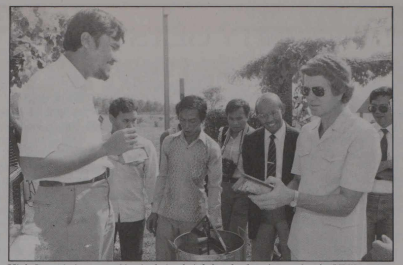
High Commissioner von Nostitz being briefed on beekeeping project by UPM expert.