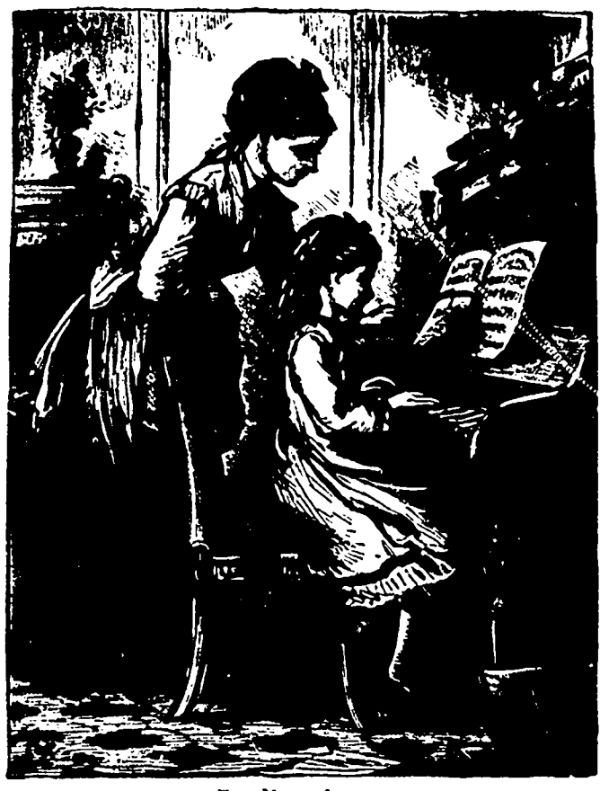
THE MUSIC LESSON.