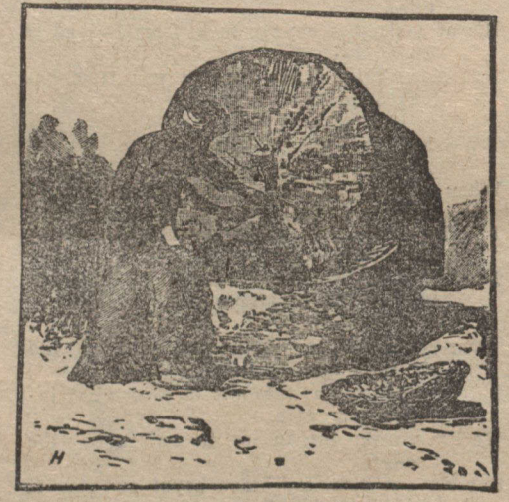
OPERATING THE OLIVE MILL

'This is truly the tree of God. With a few acres of olives a man is rich. No part of this