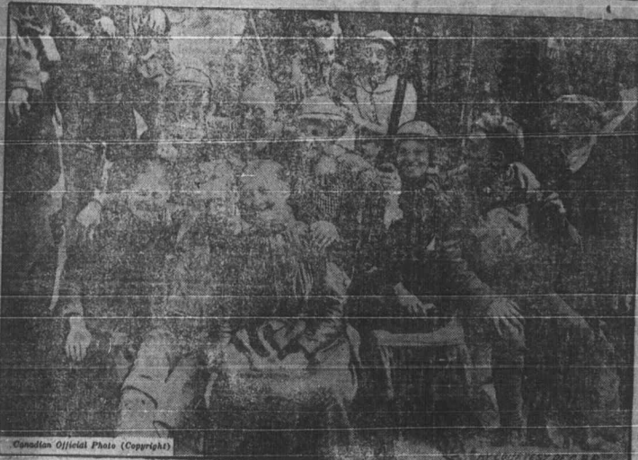
Residents of Saudemont, France, are glad to be released by the Canadians, after living in the llage with the Germans for four years.