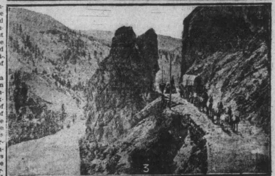
(1) An Old Time Coach. (2) Ashcroft, B.C. (3) The Old Cariboo Trail. abound in the tales of the old-timers, as the lonely and neglected graves add their pathetic note. One doubts if there is another stretch of country in Canada's far-flung area that is quite like the Cariboo trail. Evidences abound of untold mineral wealth. Forests clothe

many a hillside. Thriving farms are appearing in fertile pockets in the valleys, a large aggregate of business is transacted along the route and the entire region affords an ideal and unique route for the traveller who is looking for new scenes and fresh experiences.