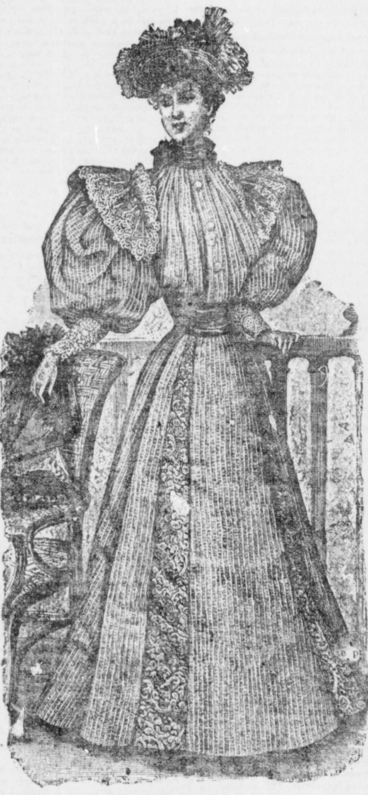
SILVER GREY CREPON GOWN