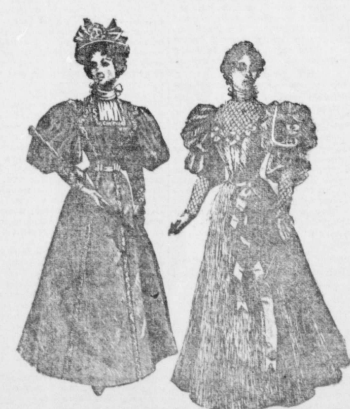
WOOL GOWN IN PRINCESS STYLE, CREPON GOWN, RIBBON TRIMMED.