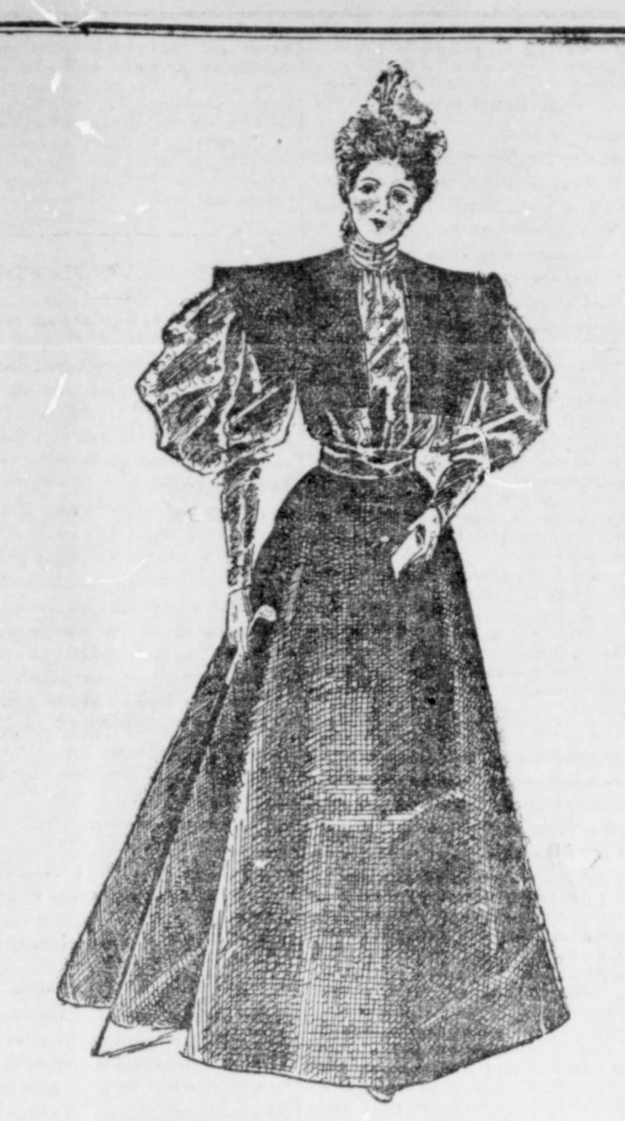
STREET GOWN FOR EARLY AUTUMN.

neath his hips, the lame then appearing to issue from his mouth—an effect which was aided by the performer's opening the latter very wide and throwing his head back. The stage was always dimly lighted, and but slightly inclined, making it still more difficult to distinguish the tubes. Thus is another of these claver feats removanother of these clever feats removed from the domain of wonders.