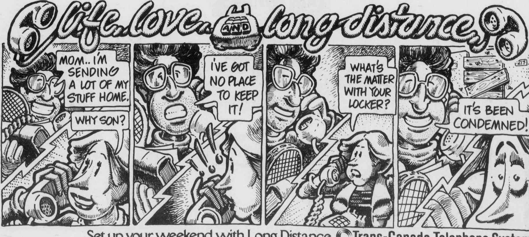
Set up your weekend, with Long Distance. Trans-Canada Telephone System