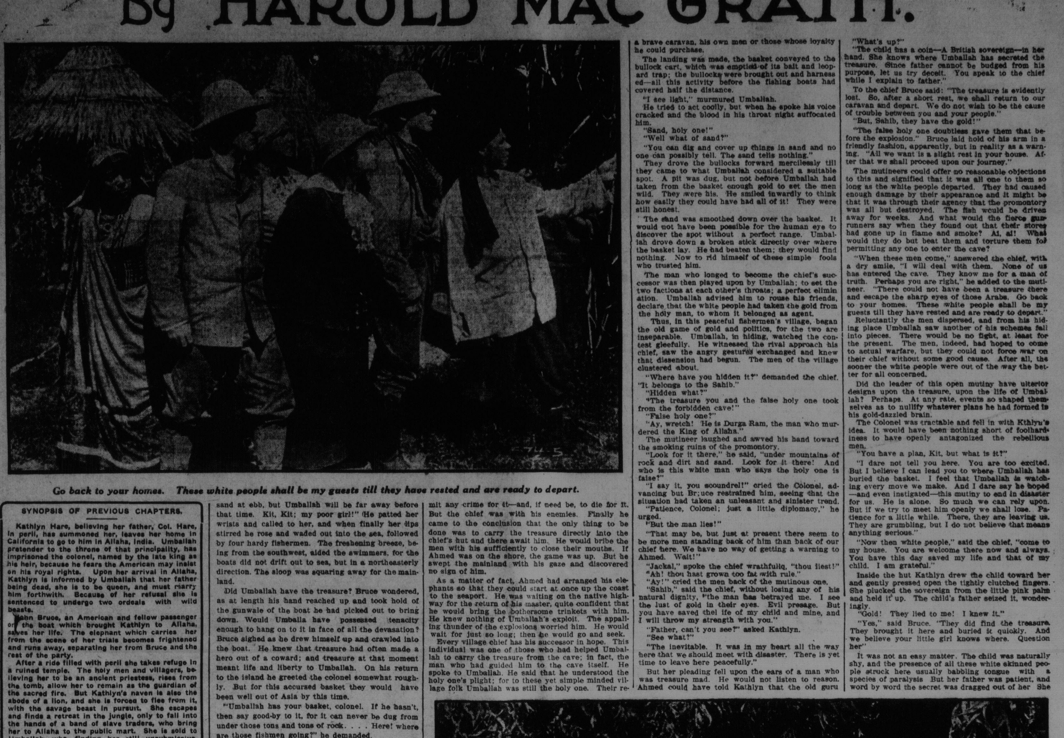
Go back to your homes. These white people shall be my guests till they have rested and are ready to depart.