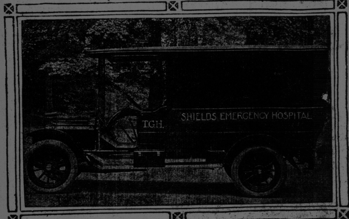
This is the new emergency motor ambulance attached to the Toronto General Hospital. It is fitted with an operating table and all such appliances and a surgeon will go out with it in an accident call. It is thought that this aid to emergency surgery may result in saving many lives.