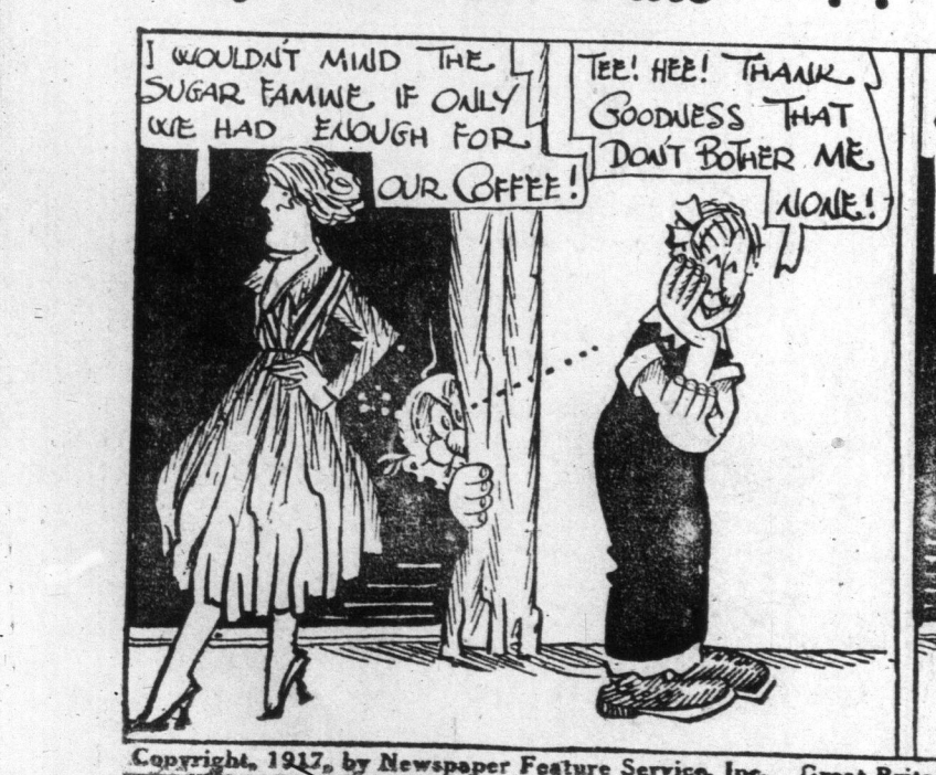
Copyright, 1917, by Newspaper Feature Service, Inc. Great Britain rights reserved. Registered in U. S. Patent Office.