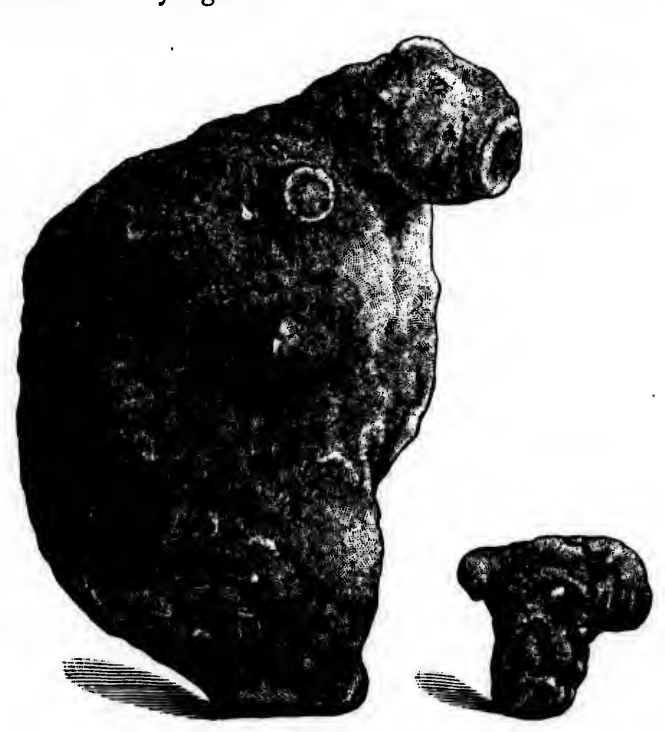
Side view, natural size.

After washing out the wound thoroughly with a 1:2000 solution of corrosive sublimate, and introducing a large drainage tube, the wound was brought together with silk sutures and dressed with sublimate jute pads. At the close of the operation the patient was in a fairly good condition, and did not show much evidence of shock; and, although he