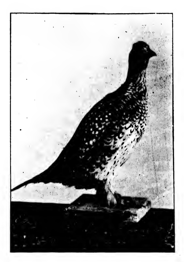
PEDIOCÆTES PHASIANELLUS (Sharp-tailed Grouse, or Old Manitoba Prairie Chicken)