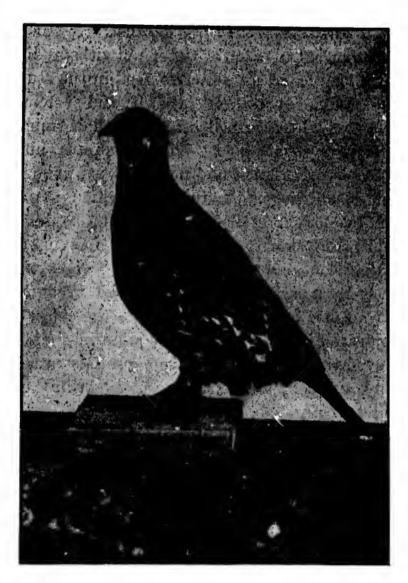
DENDRAGAPUS CANADENSIS. (Canada Grouse or Spruce Partridge). Male.

Regarding the migration of birds, its cause and effect, much controversy annually takes place without very definite solutions