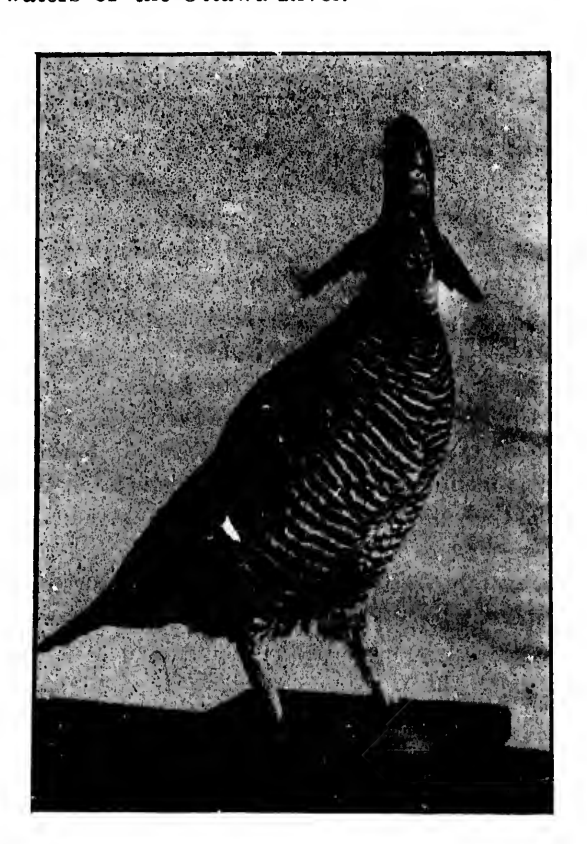
TYMPANUCHUS AMERICANUS. (Pinnated Grouse or New Manitoba Prairie Hen)

campestris), being uninclined to adopt civilized habits, has retired to the wilder and more unsettled parts of the province, and in one case extending its range eastward into the wooded country of the Rainy River and Algoma Districts of Northwestern Ontario, is regularly recorded now at Lake Tamiscamingue, the head waters of the Ottawa River.