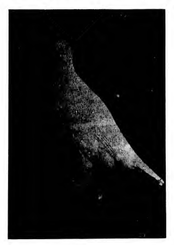
I,AGOPUS I,AGOPUS (Willow Ptarmigan)

(c) Fuligulinae.—Sea and Bay Ducks: Bill and tarsus as in Anatinae; hind toes lobed; altogether a rounder duck than the the Anatinae. Includes bluebills, whistler, redbead, canvasback, scoters, cowheen and eiders, with fifteen local representatives.