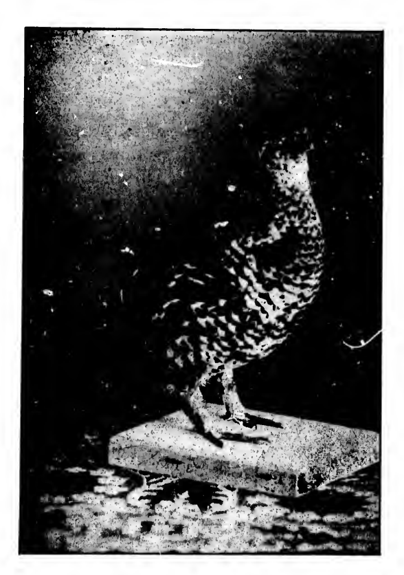
DENDRAGAPUS CANADENSIS (Canada Grouse or Spruce Partridge). Female.

As to the origin of birds and their place in nature, much