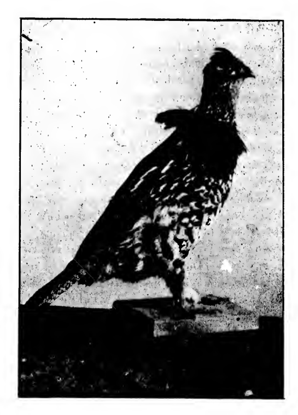
BONASA UMBELLUS (Ruffed Grouse, or wrongly called Canadian "pheasant."

These and many other characteristics make our birds exceedingly interesting subjects of study. Yet how many opportunities we miss of watching the life of the birds. How many secrets we lose by carelessness. How often we feel tired with