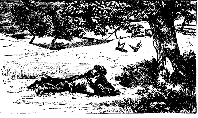
THE BOYS AND THE BIRD'S NEST.

The International Lesson Plan: The Lesson Committee. The Selection of Lessons.