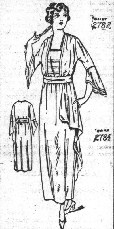
Waist 2782, and Skirt 2784. Comprising Ladies' Waist Pattern 2782, and Ladies' Skirt 2784. Taupe crepe meteor, or georgette crepe combined with satin would be attractive for its development.

The Waist 2782 is cut in 6 sizes: 34, 36, 38, 40, 42 and 44 inches bust measure. The Skirt 2784 in 6 sizes: 22, 24, 26, 28, 30, and 32 inches waist measure. It will require 7 yards of 44 inch material to make the dress for a medium size. The Skirt measures about 1 1/2 yards at the foot.