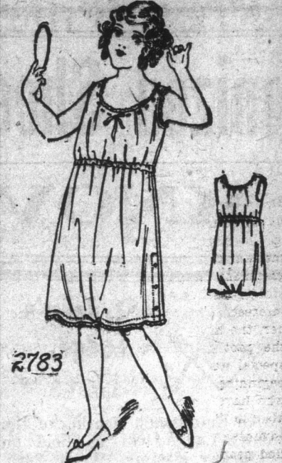
2783—This style is good for lawn, fabric, nainsook, batiste, washable satin, crepe and silk. The clothing is effected at the sides.