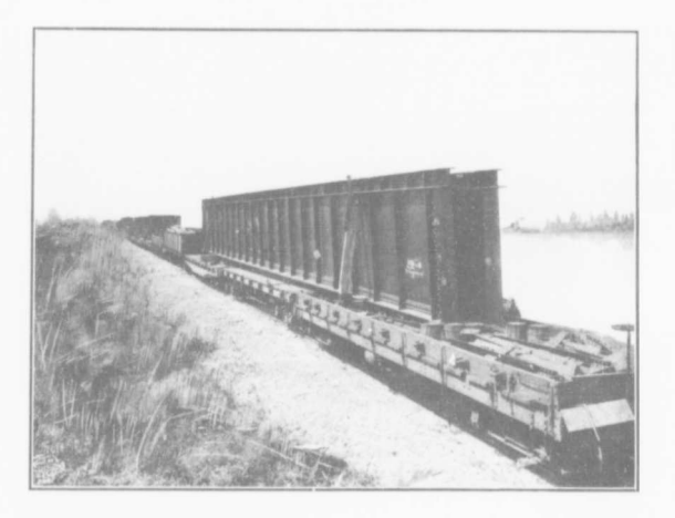
FLAT CARS Supplies of the Canadian Northern Pacific Railway Company for Construction Work

The location of the roundhouse and repair shops is about one mile west of Bon Accord Square on the