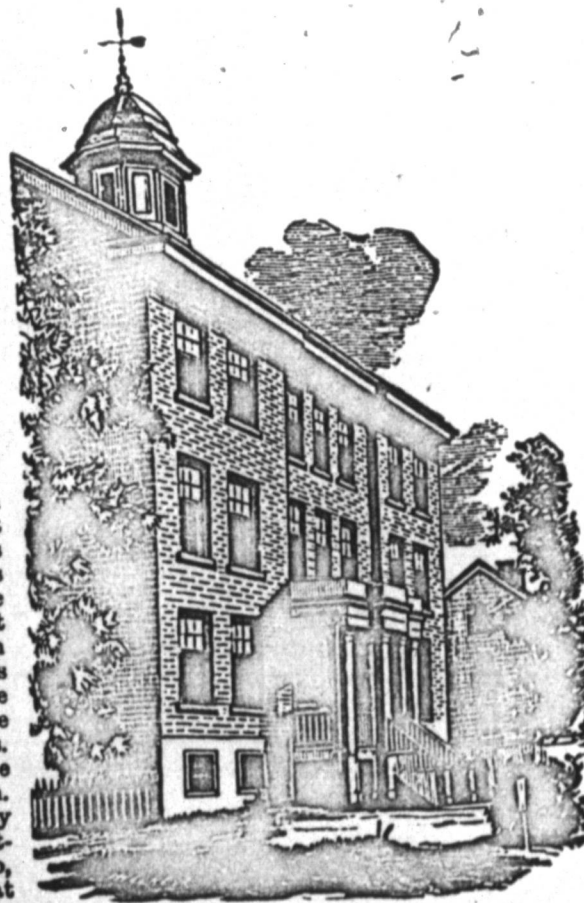
BOYS' SCHOOL, POINTE-AUX-TREMBLES.