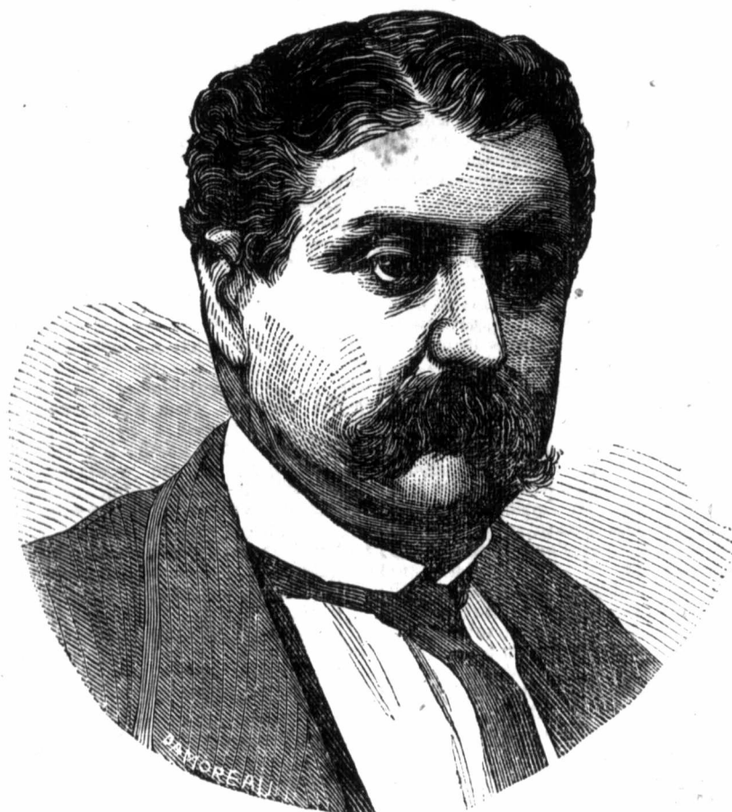
JAMES FISK, JR.

shall take up of Civiliza- the story of well, not be- but because it affords the times in possible, and ructive epoch many forcible y the story of