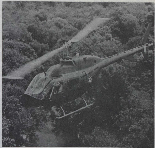
The Kiowa in flight.

The Minister of Defence, Mr. Donald Macdonald, accepted the first of 74 new "air jeeps" for the armed forces on December 16 in a ceremony at Canadian Forces Base Uplands. The new aircraft, the Kiowa helicopter, is a military version of the Bell Jet Ranger , ordered for the armed forces land element to broaden operational mobility and flexibility.