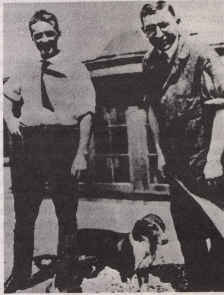
Experimenting with this dog, Marjorie, Frederick Banting (right) and Charles Best demonstrated that insulin could control diabetes.

It was on May 17, 1921 that Banting outlined his theory to Best that he be-