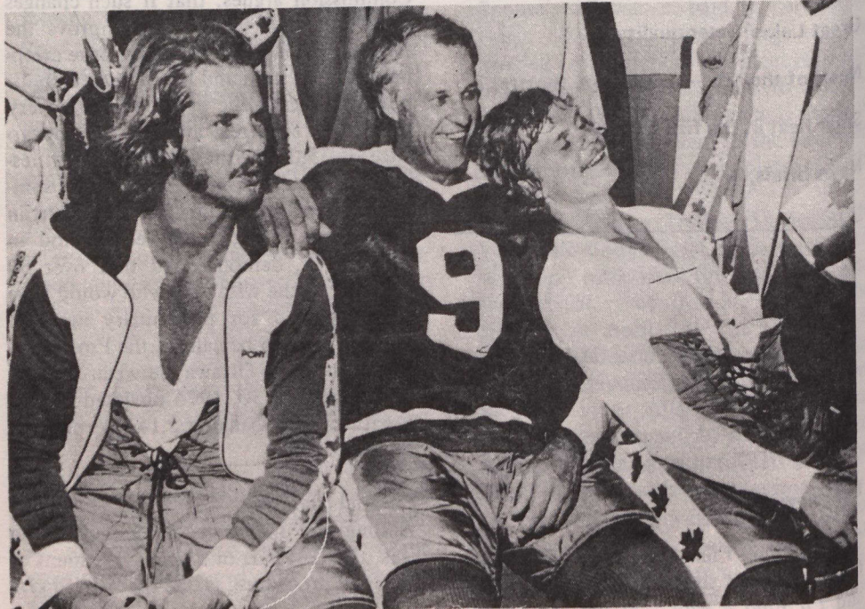
Gordie Howe, with his two sons Mark (left) and Marty rest, after a practice game before the 1974 Canada/U.S.S.R. hockey series.

Detroit colleagues were there, as well as baseball veteran Al Kaline, tennis champion Tony Trabert and track star Jesse Owens.