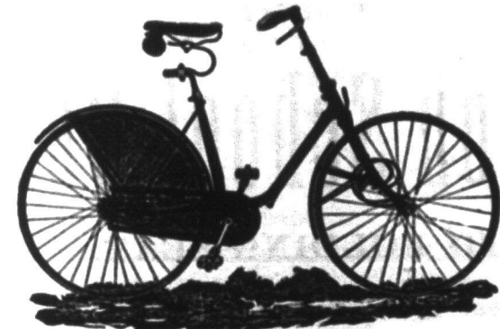
LADIES' SAFETY BICYCLE.

We shall be pleased to send on request our Illustrated Catalogue of