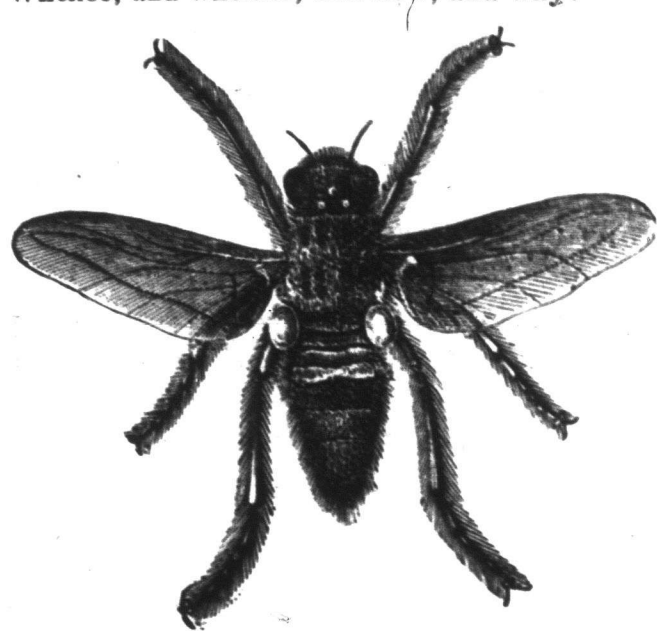
THE OX GAD FLY.—(Magnified.)

Flighty, flitting, fluttering fly! Whence, and whether, and how, and why?