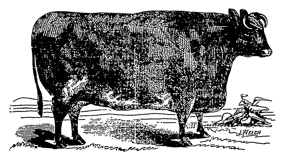
NECKLACE-A SHORT HORN COW.